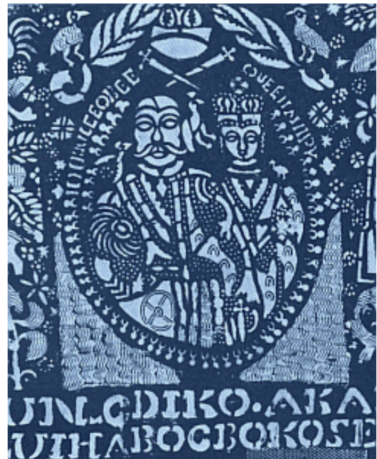
// Figure 02 Adire Oloba (detail of cloth), 20th century, cotton.