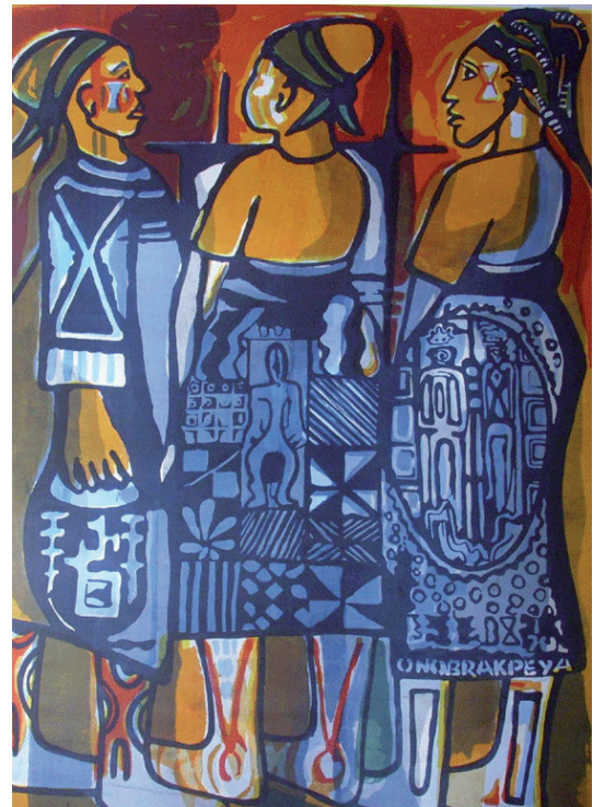
// Figure 04 Bruce Onobrakpeya, Untitled, 1959, painting.