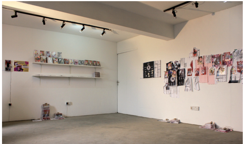
// Figure 06 Temitayo Ogunbiyi, Lovely Love Text Message Books , installation at the Centre for Contemporary Art, Lagos, 2012.

7. CONCLUSION — In conclusion, we see in Ogunbiyi's work a navigating of a mixed, multinational identity where issues of gender are addressed through the appropriation of specific textiles whose histories reveal narratives of resistance, agency, and