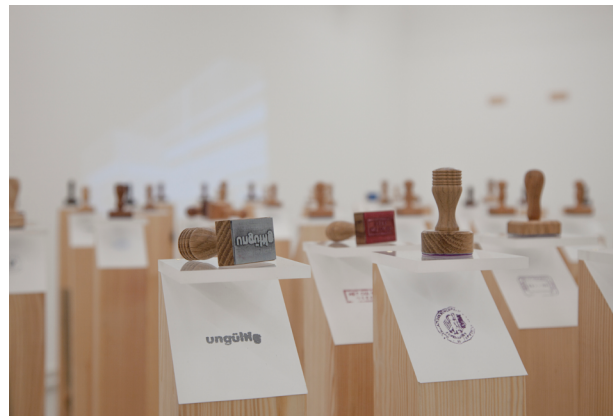
Abb. 4: Khaled Barakeh, Self Portrait as a Power Structure , 2018