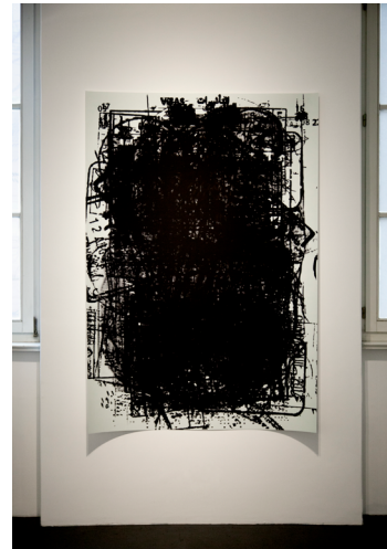
Abb. 3: Khaled Barakeh, I Haven't Slept for Centuries , 2018