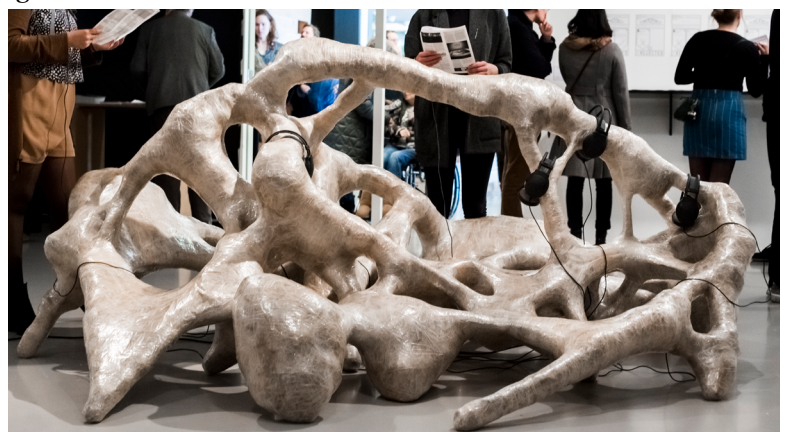
Fig. 1: Libia Castro and Ólafur Ólafsson, Bosbolobosboco , 2014

EMPATHETIC REPRESENTATIONS — One of the strategies often used by contemporary artists to discuss migrations, and direct the public’s attention towards the idea of an urgent humanitarian crisis that needs solving, is to emphasize on the notion of empathy; in doing so artists often choose to rely on the evocation of individuals’ experiences. This is the case in Libia Castro and Ólafur Ólafsson’s 2014 audio sculpture Bosbolobosboco #6 (Departure-Transit-Arrival) , the sixth work in a series of sculptures gathering audio montages concerned with various themes. This particular one focuses on experiences of migrations, as it invites visitors to take place in a biomorphic structure [fig. 1] and listen to an assemblage of migrants’ personal testimonies. The audio describing these departures and migrations, is supposed to be heard through a process of ‘deep listening’, according