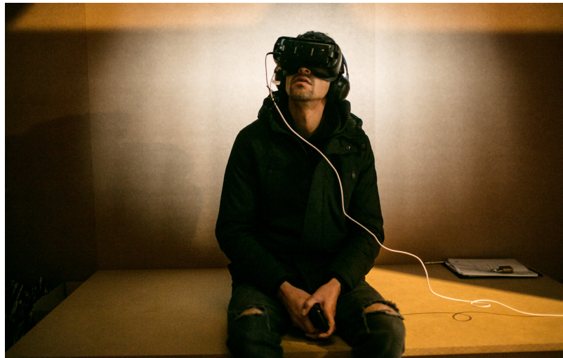
Fig. 1: Installation shot of Pejk Malinovski's This Room at Copenhagen Central Station. © Pejk Malinovski. Photo: Ole Bo Jensen

— In my article, I will approach the topic of this special issue, i.e. critical responses to the ‘refugee crisis’ in art, through a case study of this specific installation project. In 2015–2018 I conducted a practice based curatorial research project entitled Transit: Art, Mobility and Migration in the Age of Globalization . The project took its thematic point of departure in the ‘refugee crisis’